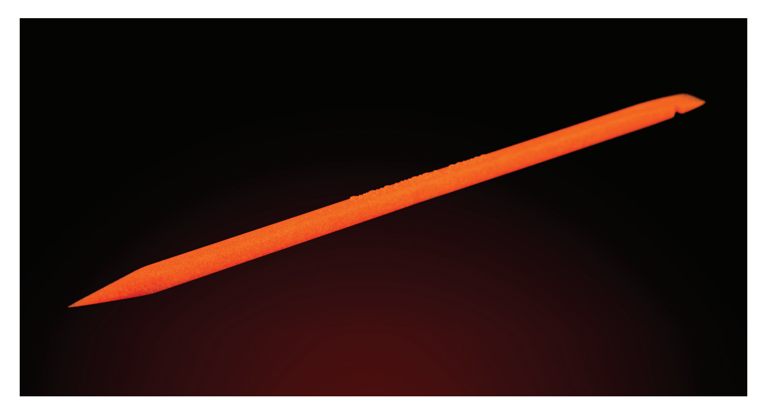
Semco GID Sealant Pick: 235038