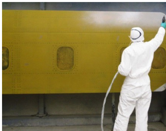
Application of Desoprime™ CA7530 pre-treatment primer

As environmental regulations move to reduce the use of chrome 6, alternatives for corrosion protection will be needed by the aerospace industry. PPG is committed to providing our customers with eco-friendly products that