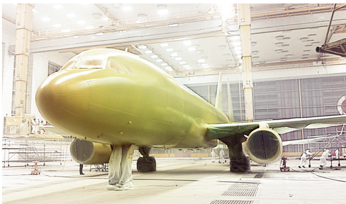
Completed application of Desoprime™ CA 7530, chrome-free, corrosion-inhibiting epoxy primer

Corrosion is very damaging to airframe surfaces and structures and may impact flight safety if preventative actions are not taken. Protecting aircraft from corrosion is a top priority for aerospace OEMs, airline operators, the military, and PPG. For many years, aerospace coatings contained hexavalent chromium (chrome 6), an anticorrosive agent, to help protect aircraft from corrosion. Environmental regulations are being enacted that will prohibit the use of hexavalent chromium because of the health and