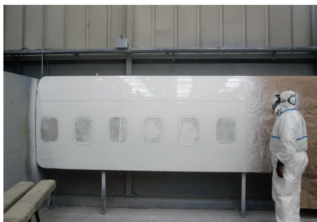
Application of Desoprime™ CA7065 high solids, chrome free polyurethane primer