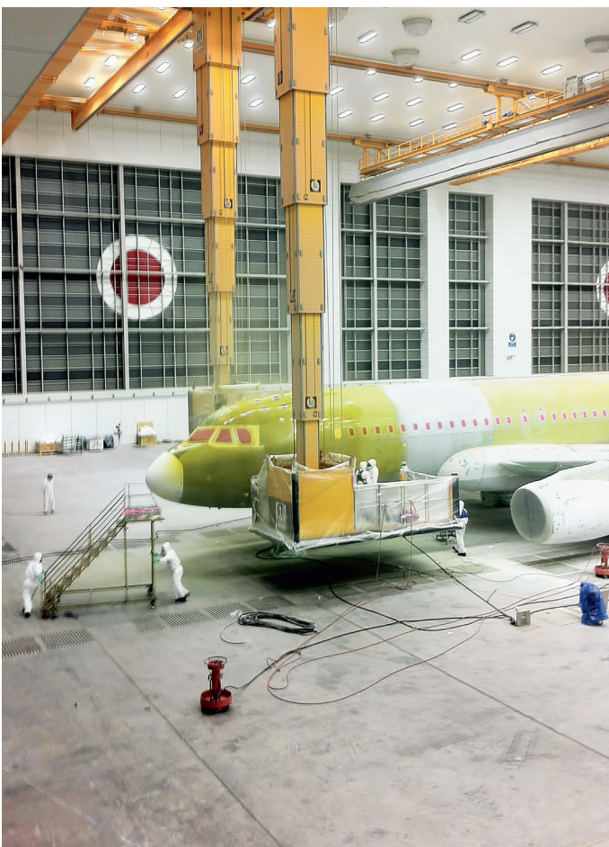
Application of chrome free wash primer during aircraft repainting

protect the aircraft from corrosion and the environment from chromium.